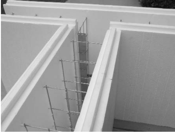
BUTT FORMS TOGETHER