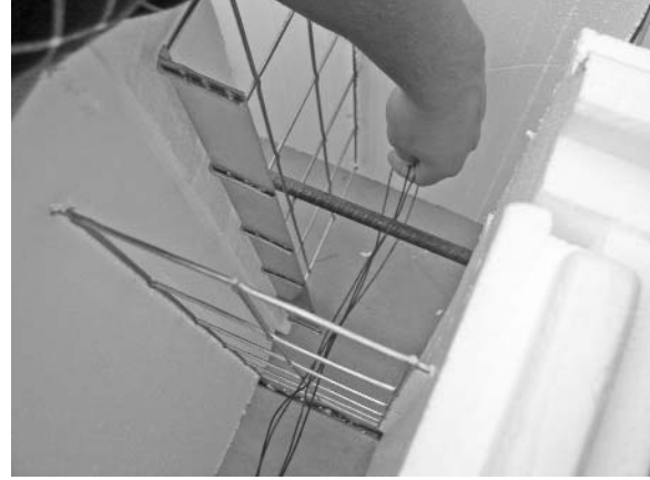
FIRMLY SECURE WITH WIRE