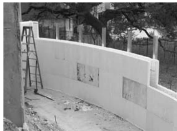
FORMS IN PLACE